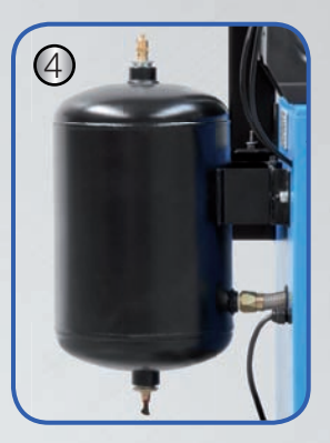
(1) Powerful bead breaker (2) Fine adjustment by joystick (on the mounting arm) (3) Help-arm with bead roller, bead presser and bead loosening disk (4) Large air tank for the integrated air boosters in the mounting jaws