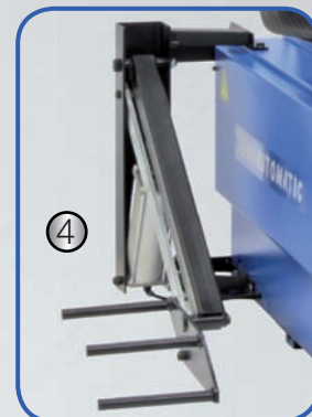
(1) Help-arm for professional use (2) Comfortable and clear tire inflator (3) Self centering wheel mounting system (4) Wheel lifter