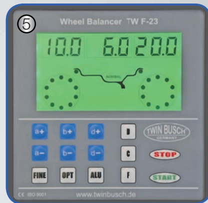
(1) 15 storage compartments (2) Accurate targeted mounting of all the weights using the electronic caliper arm (3) Integrated distance measurement (4) Quick release nut \varnothing = 40 mm (5) Digital Display (The new, compartment design ensures maximum user comfort and optimal ergonomics)