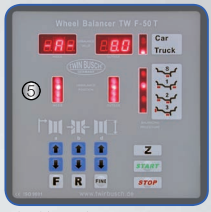
(1) 13 storage compartments (2) ON/OFF switch (3) Foot brake (4) Convenient joystick control (5) User friendly keypad for easy data input, slanted display for optimal readings