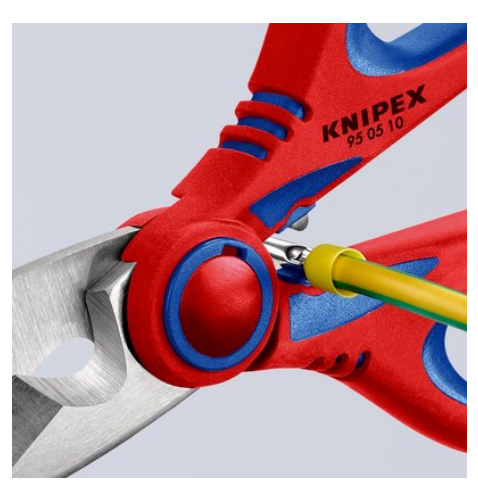
95 05 10 SB: Fast, easy crimping