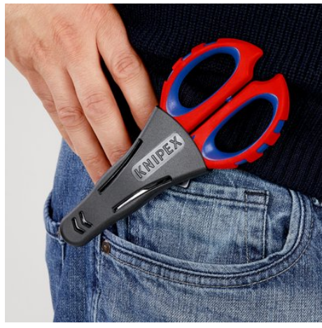
Securely stowed and always at hand