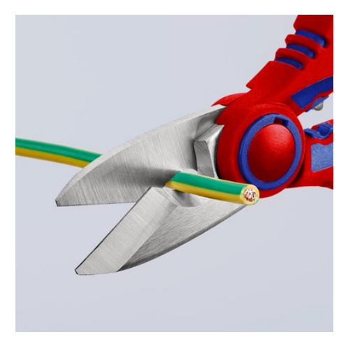
Integrated cable cutter