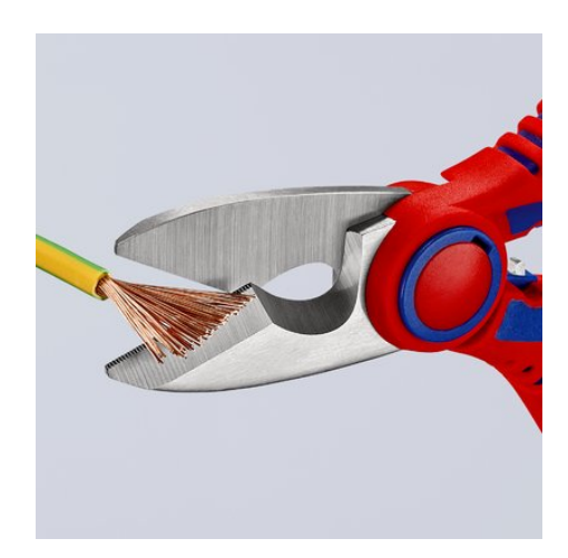
No slipping thanks to micro-serration